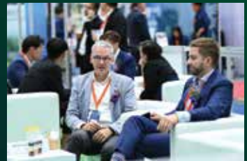
HOSTED BUYERS PROGRAM