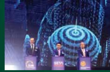
DIGITAL TO ENERGY FORUM