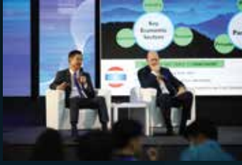
CEO ENERGY FORUM