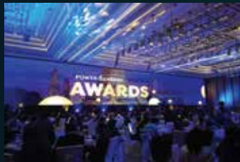
EXCLUSIVE ENERGY AWARDS