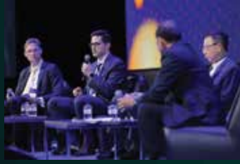
ZERO CARBON FORUM