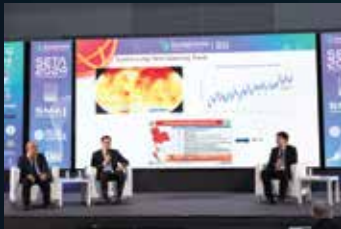
SOLAR + STORAGE FORUM (THAI SESSION)