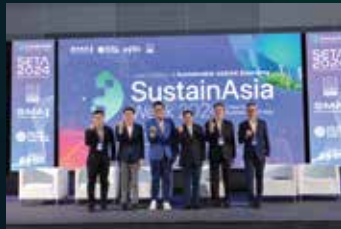
TECH HUB / INNOVATION HUB KNOWLEDGE HUB