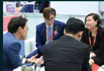
BUSINESS TO BUSINESS MATCHING