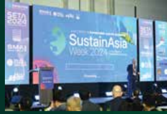
HYDROGEN & AMMONIA FORUM