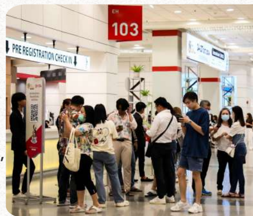
EXHIBIT PROFILE: Manufacturers, suppliers, distributors, and importers from