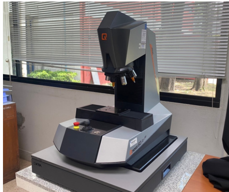
Qness Hardness Tester