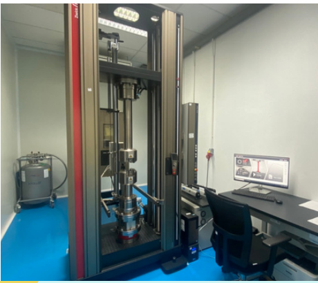
Universal Testing Machine