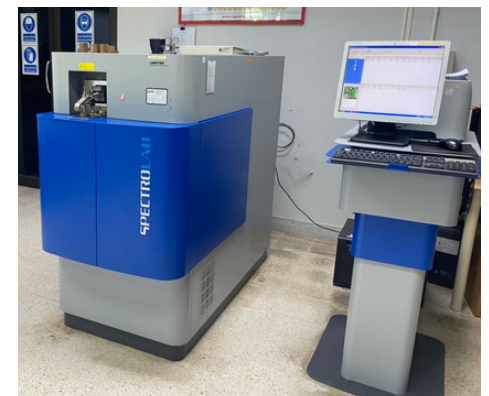
Optical Emission Spectroscopy