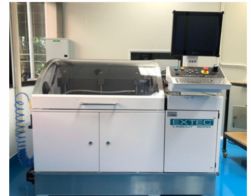
Extec Labcut 5000®